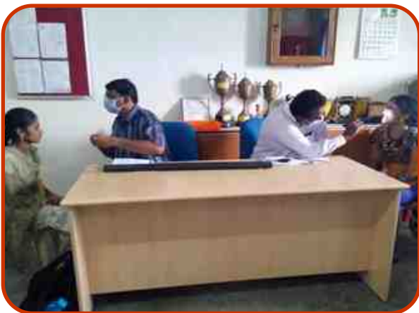
Free Dental Checkup Camp