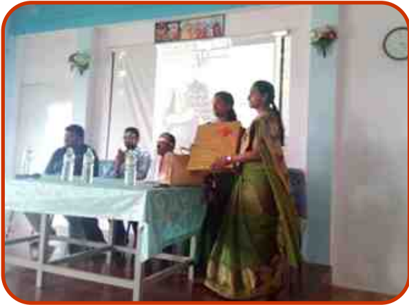
Netraamrutham Free Eye Checkup Camp