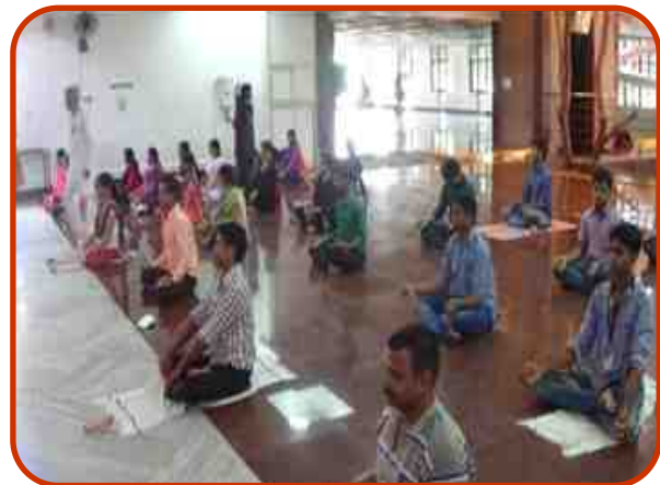
Yogaamrutham (7 days yoga training program)