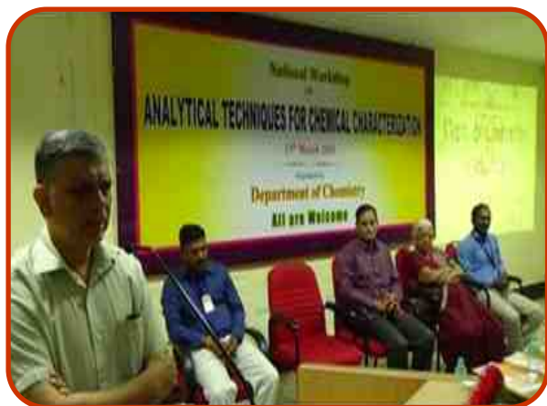
Analytical Techniques for Chemists