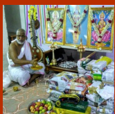
Saraswathi Pooja, 2016