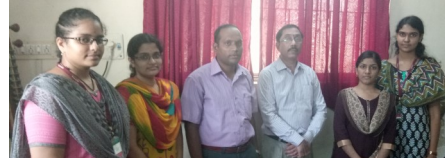
Jyotishmati 2 participants