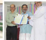
Vagvi- lasini Sep 2016