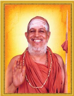
JAGADGURU SRI JAYENDRA SARASWATHI SWAMIGAL