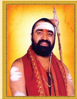
JAGADGURU SRI SANKARA VIJAYENDRA SARASWATHI SWAMIGAL