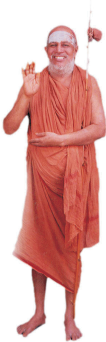
Jagadguru Sri Jayendra Saraswathi Swamigal Patron