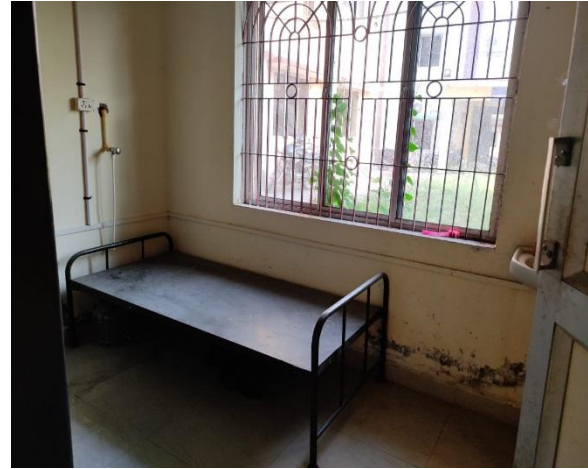
Ladies Common Room – Dept. of CSE