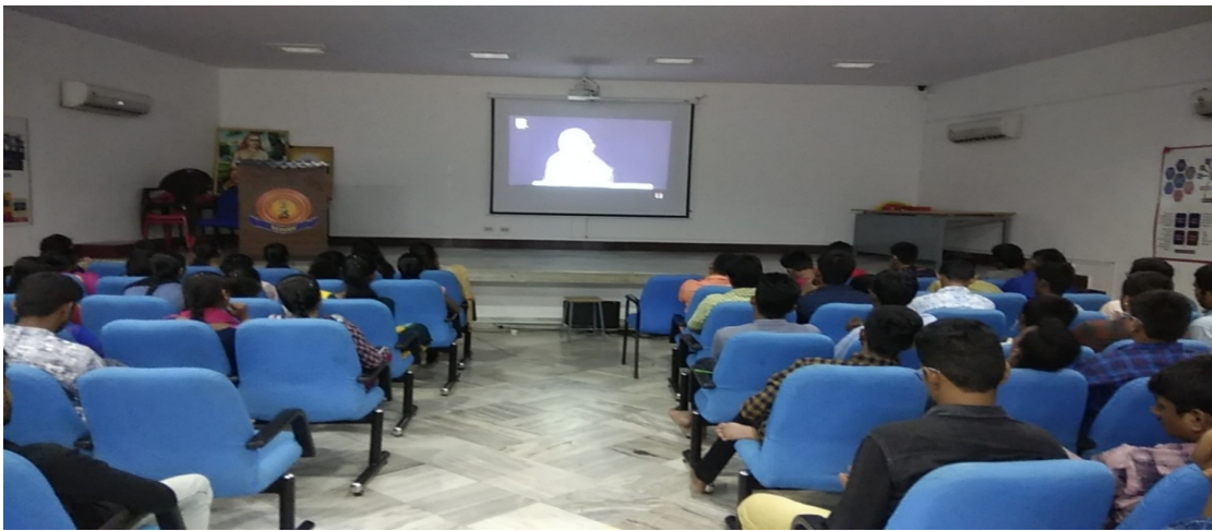
Honourable Prime Minister delivers a speech on FIT INDIA MOVEMENT.