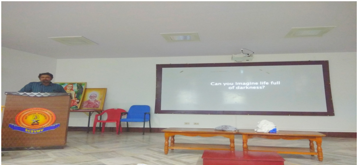
The talk drew a total of 100 NSS volunteers