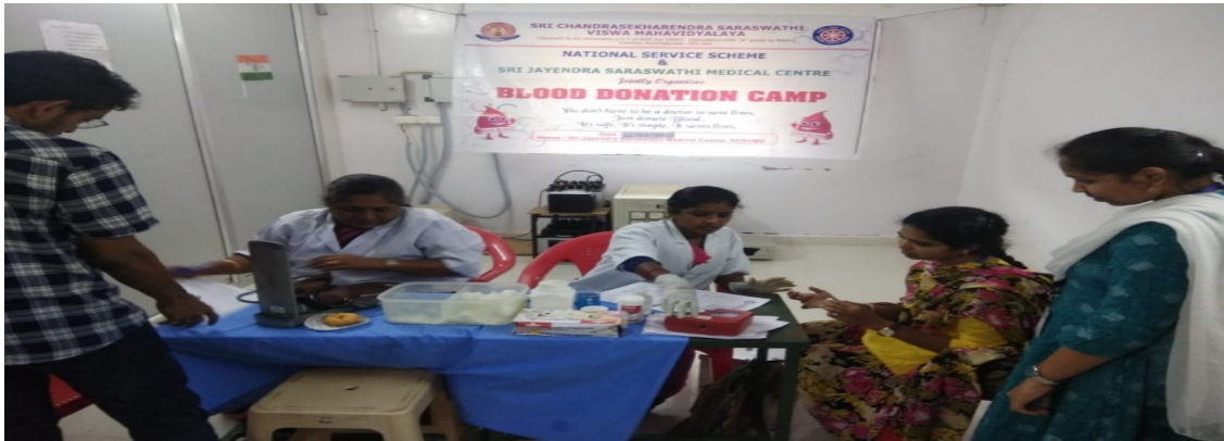
Finally, the doctor certified the students' and permitted them to donate blood.