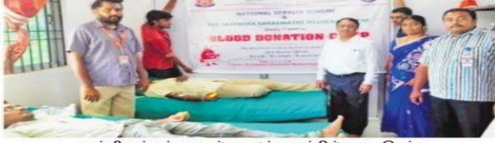
காஞ்சிபுரம் சங்கரா பல்கலைக்கழகத்தில் நடைபெற்ற ரத்த தான முகாமில் பங்கேற்றோர்.

காஞ்சிபுரம், செப்.3: காஞ்சிபுரம் ஏனாத்தூரில் அமைந்துள்ள சங்கரா பல்கலைக்கழக நாட்டு நலப் பணித் திட்டம் சார்பில் பல்கலைக்கழக வளாகத்தில் உள்ள ஜெயேந்திர சரஸ்வதி மருத்துவ மையத்தில் ரத்த தான முகாம் செவ்வாய்க்கிழமை நடைபெற்றது.