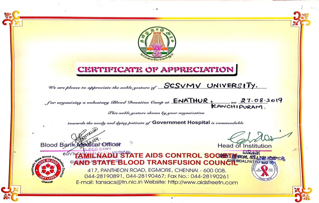
Cuttings from Tamil new papers relating to a blood donation camp.