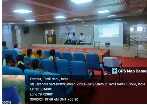
Enathur, Tamil Nadu, India Sri Jayendra Saraswathi Street, VP6H+JW5, Enathur, Tamil Nadu 631561, India Lat 12.861498° Long 79.72986° 30/03/24 10:46 AM GMT +05:30