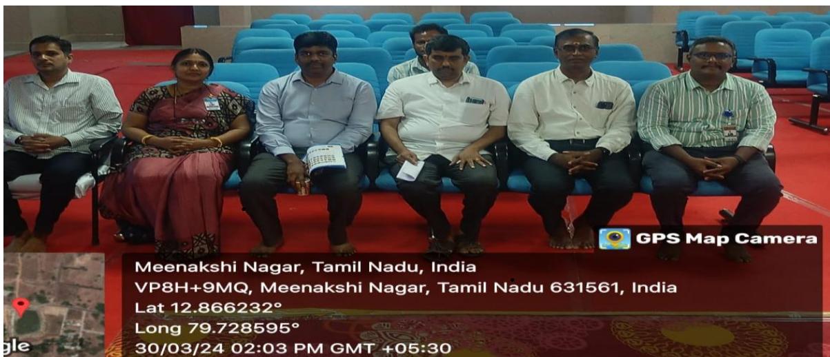
Meenakshi Nagar, Tamil Nadu, India VP8H+9MQ, Meenakshi Nagar, Tamil Nadu 631561, India Lat 12.866232° Long 79.728595° 30/03/24 02:03 PM GMT +05:30