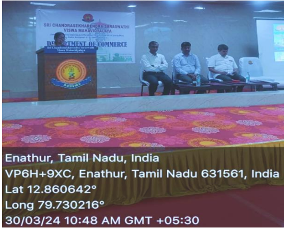
Enathur, Tamil Nadu, India VP6H+9XC, Enathur, Tamil Nadu 631561, India Lat 12.860642° Long 79.730216° 30/03/24 10:48 AM GMT +05:30