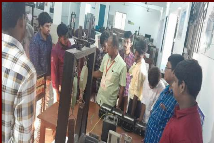
Enathur, Tamil Nadu, India Jayendra Saraswathi Street, SCSVMV, VP5J+J3W, Enathur, Tamil Nadu 631561, India Lat 12.859016° Long 79.730044° 21/08/24 02:26 PM GMT +05:30