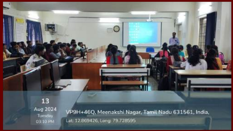
13 Aug 2024 Tuesday 03:10 PM VP9H+46Q, Meenakshi Nagar, Tamil Nadu 631561, India, Lat: 12.869426, Long: 79.728595