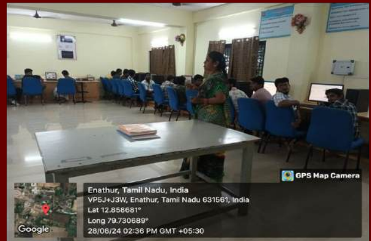
Enathur, Tamil Nadu, India VP5J+J3W, Enathur, Tamil Nadu 631561, India Lat 12.858681° Long 79.730689° 28/08/24 02:36 PM GMT +05:30