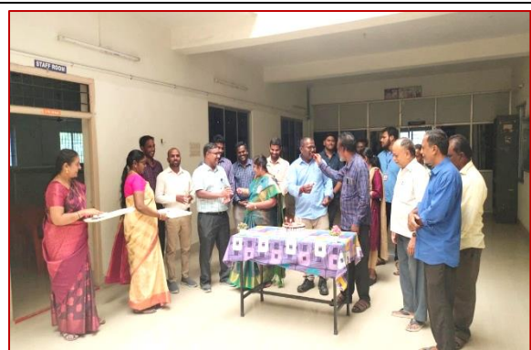
Cakes distributed to the students and staffs