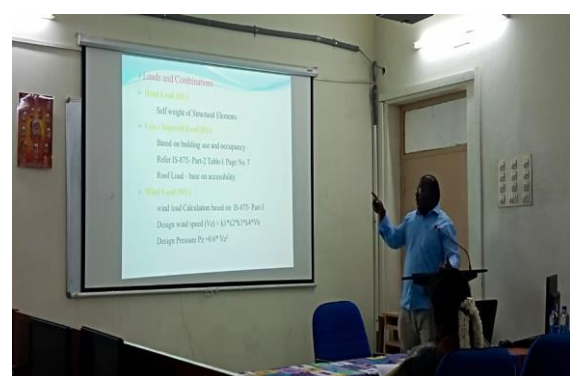
Lecture given by the Speaker