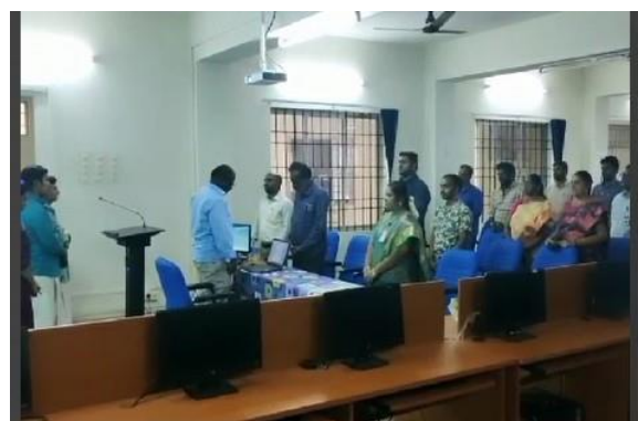
Prayer song by Sanskrit students