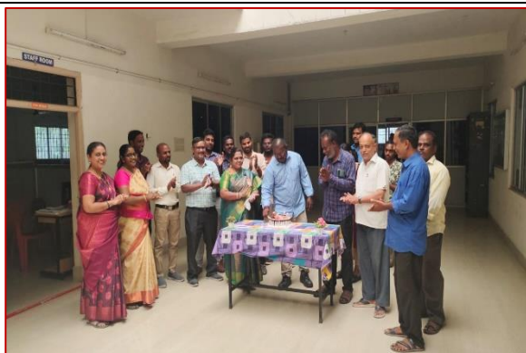
Cake cutting by the Guest