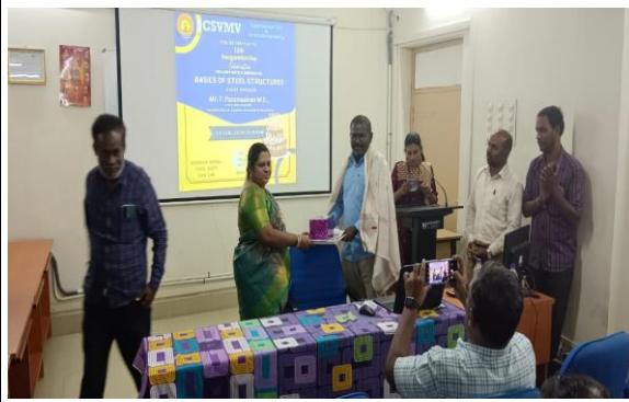
Honoring the Chief Guest