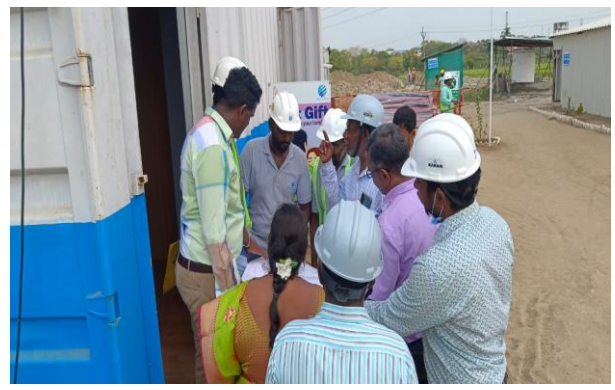
Plan Shown by the Site Supervisor