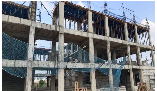
College Building-Front view