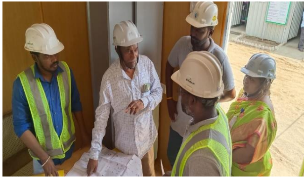
Discussion about Plan