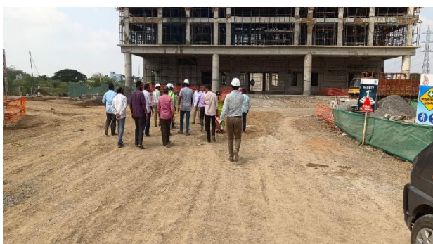
Nursing College building