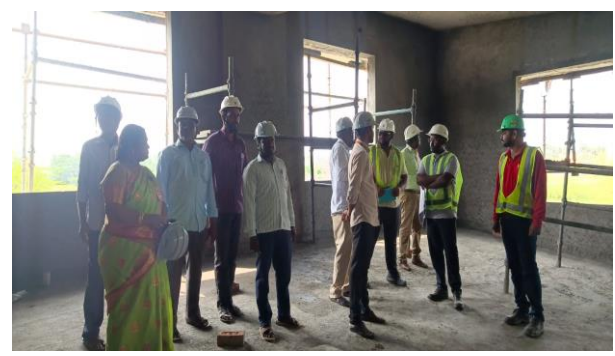
Class Rooms with Gallery Arrangement